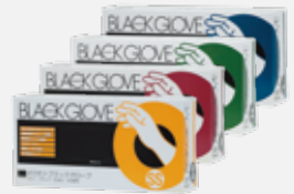
Okamoto Black Gloves